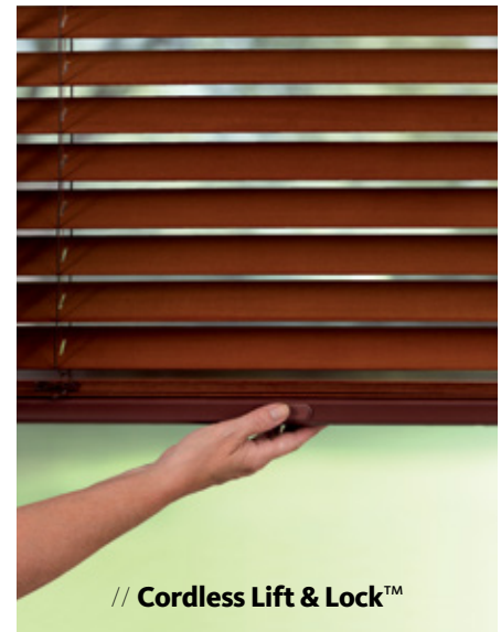
// Cordless Lift & Lock™