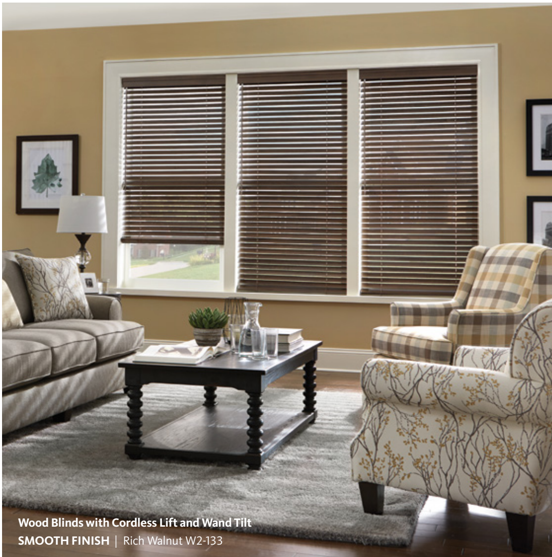
Wood Blinds with Cordless Lift and Wand Tilt SMOOTH FINISH | Rich Walnut W2-133